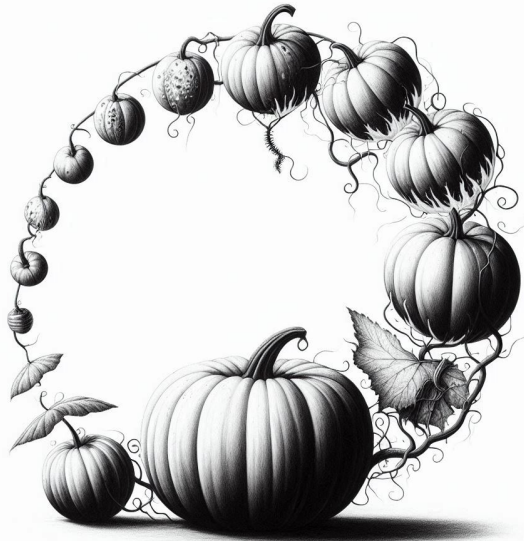
The lifecycle of a pumpkin