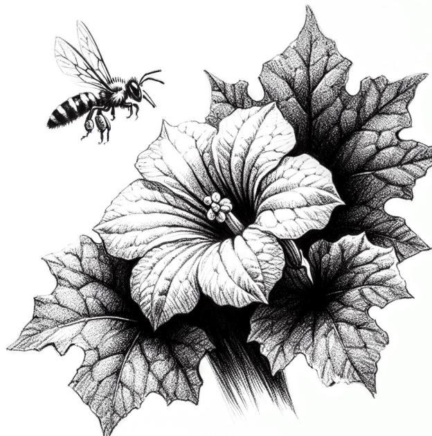
flowering and pollination